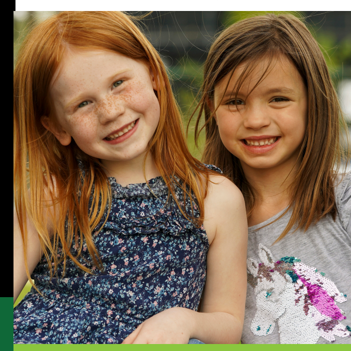
Supporting Shorewood Schools for 20 Years

The 2023–2024 Annual Campaign August 1, 2023 – July 31, 2024